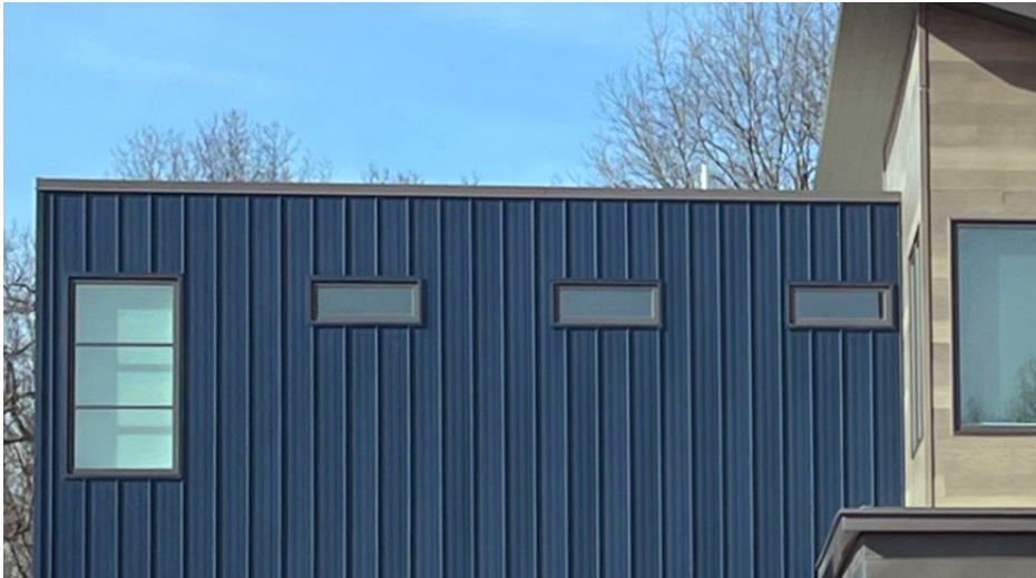
MS 750 I